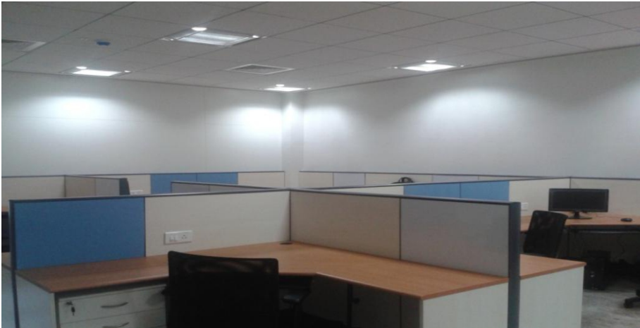
Office Lighting Installation