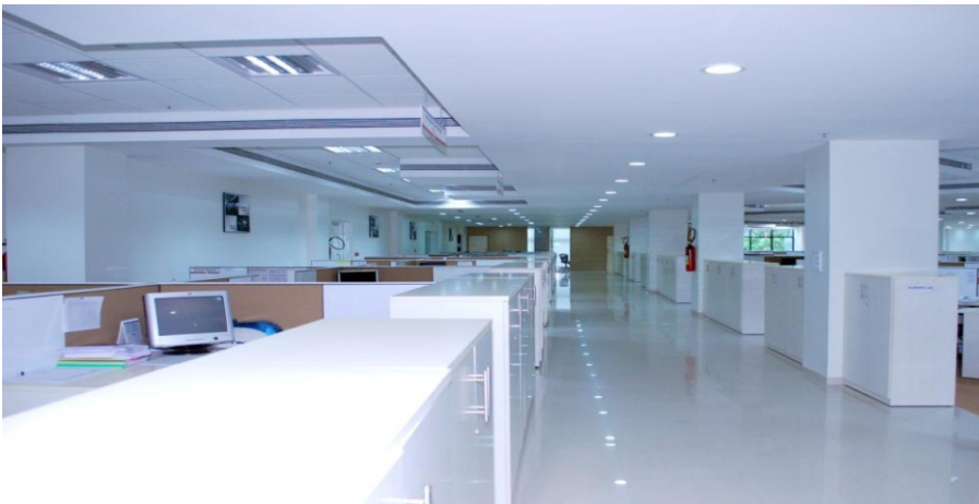
Office Lighting Installation