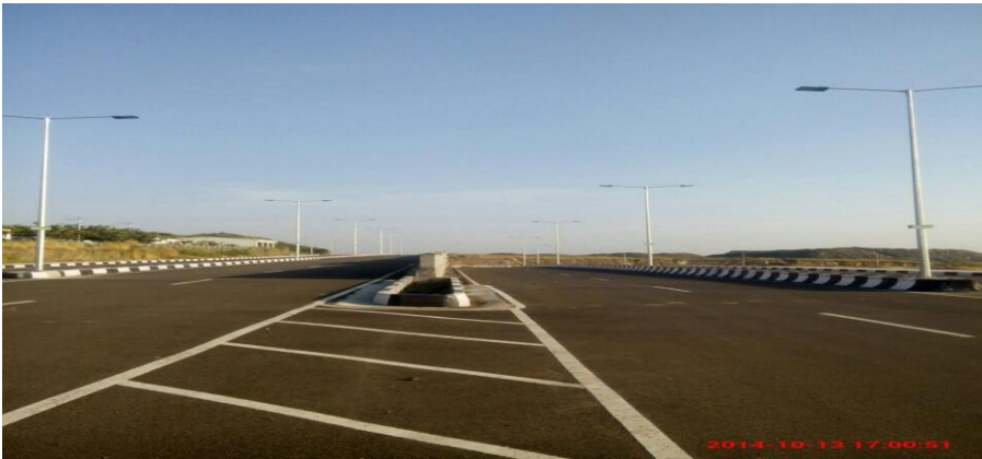
External Lighting Installation