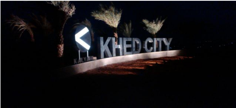
External Lighting Installation